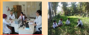
Воҳӯри бо ҳаياتи кормандони Озмоишгоҳ