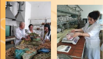
Гузаронидани корҳои илмӣ тадқиқотӣ дар озмоишгоҳи таҳлили умумӣ