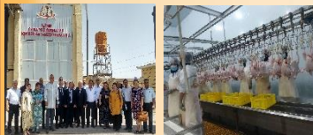
Иштирок дар семинарҳои илмӣ-амалӣ