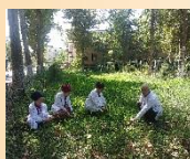
Иштироки кормандони озмоишгоҳ дар шанбегиҳо